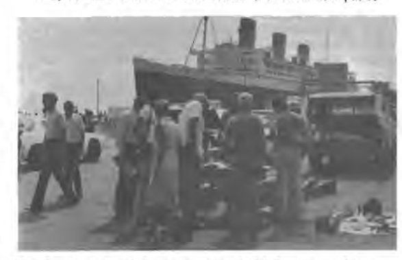
The Swap Meet and Concours were held in the parking lot right next to the Queen Mary. The panoramic view was taken from high up on the bridge of the Queen. It's hard to imagine how big it is without being there.

Besides the business going on in the parking lot, Newman & Altman and Frost & French had parts