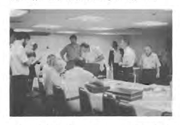
Members of the Board about to reconvene after a break.

The Board of Directors Meeting began at 9 AM Thursday morning. Since our Board only meets this one time a year, there is always a large amount of business to be conducted. The Board was treated to a special luncheon at noon in one of the ships dining rooms, and then worked straight through until supper time. After breaking for supper and