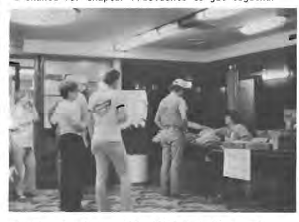
The Meet Committee sold official T-shirts and raffle tickets in the Abbey Room on the Main Deck.

Back at the Queen Mary, the evening began with the Presidents Meeting. It was originally a chance for Chapter Presidents to get together