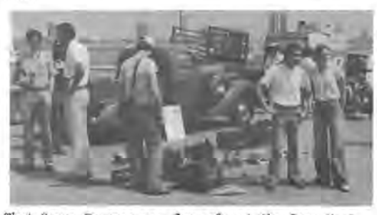
That Coupe Express was for sale at the Swap Meet.

The Meet Committee had organized the large parking lot so that cars arriving for the Concours Saturday morning would be lined up to come through one of the four drive-through juding lines with a minimum waiting with the motor running. Even with this efficient judging procedure, there were so many cars that it was late afternoon before all were processed. At the end of the judging line a photo station run by Patrick Condon took a color picture of each car in front of a group of palm trees. The meet organizers had walkie-talkies so each class was called at just the right time with a minimum of time spent waiting in the judging line.