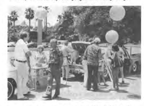
The Pennsylvania members had helium balloons to publicize next years Gettysburg '80 National Weet.

While the Board was meeting a Judges Meeting was held in the afternoon for those members who had volunteered to be judges at the concours. In this meeting the judges decide on the scoring system and split up the duties so when the cars line up on Saturday the judges are ready to get