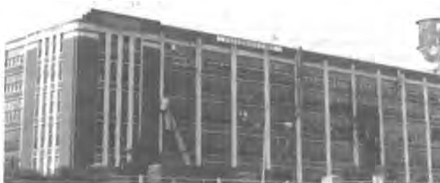
Above: All of the "bird's-eye-view" pictures on this page were taken from the roof of Building #84, at the Southeast corner. We were leaning on the three "steps" you see in the upper left. This view shows the North side of Building 84, and we again thank Ed Peterson for allowing us access to the roof for these photo possibilities!

Immediately below is the parking lot to the West of the museum, across LaFayette Street, where the C-K body cars were displayed, as well as the Modified classes. Commercial vehicle classes were shown in the lower right, South of South Street!