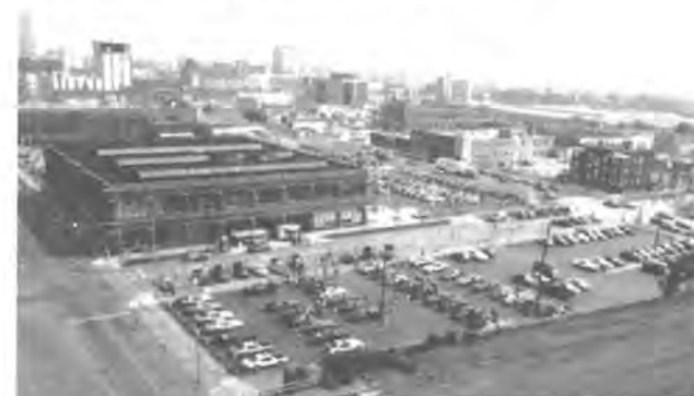
Above: Compare this photo with that in the upper left corner of Page 17 in the July Turning Wheels ! Same position, but alot more Studebakers surrounding the museum! North of the museum, at the top of this photo, is where the 1959-up non C-K body cars were displayed.