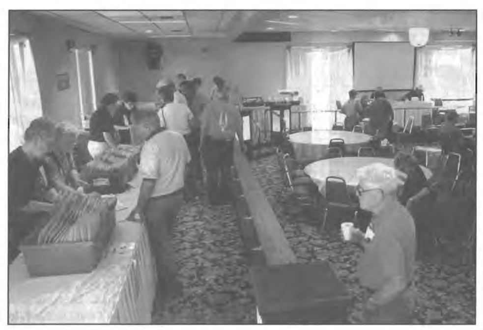
Jordanaires) entertaining and helping out where needed the rest of the week.

Monday arrived and the swap meet was in full swing and a beehive of activity. We had 52 vendors and most were under one roof in a single room. The other vendors that were outside were there by their own preference.