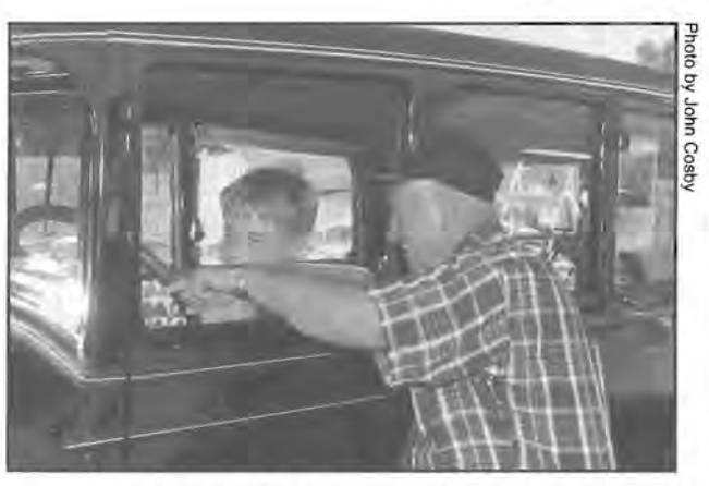
The future of SDC starts right here!

in the evening. This was probably the largest attended banquet at an International Meet with 751 people served. After the buffet everyone went into the theater for the awards ceremony. During the course of the evening entertainment was by the Valley Eight, a singing group from Scottsbluff, Nebraska. One of the numbers the group sang