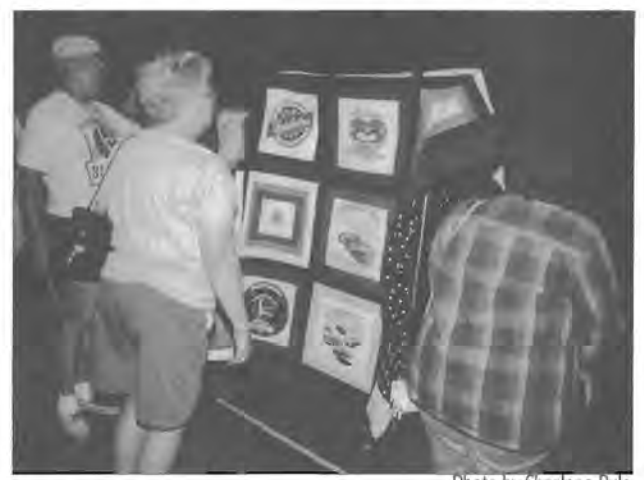
The beautiful auction quilt.

Most everyone I talked with after this Seminar said they wished it had lasted for a couple of days. If you ever