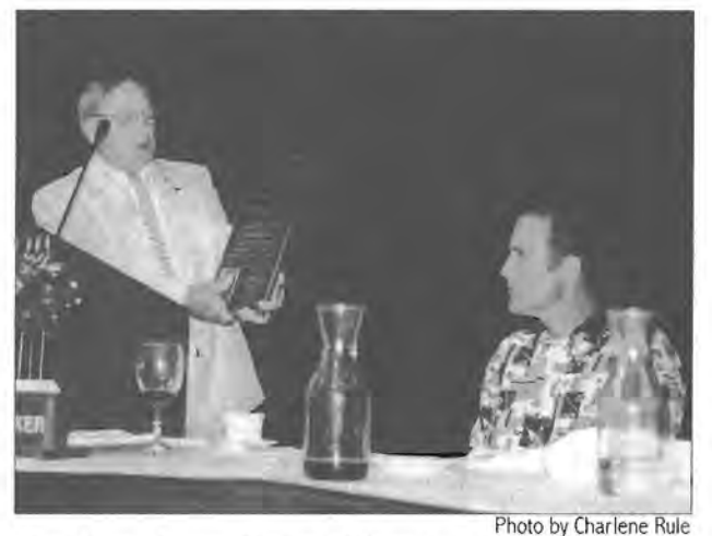
The Harry Barnes Memorial Award.

Concours, was a fabulous location for this event. It appears that just under 800 vehicles were displayed or judged to the overwhelming delight of thousands who enjoyed the sight of seemingly endless Studebakers. There were more Pre-Wars displayed than the 100-plus Avantis. There were Trucks, Modifieds, Champs, Commanders, Hawks, Speedsters, Larks, Presidents and Scotsmans; it was unbelievable! If you missed this Meet,