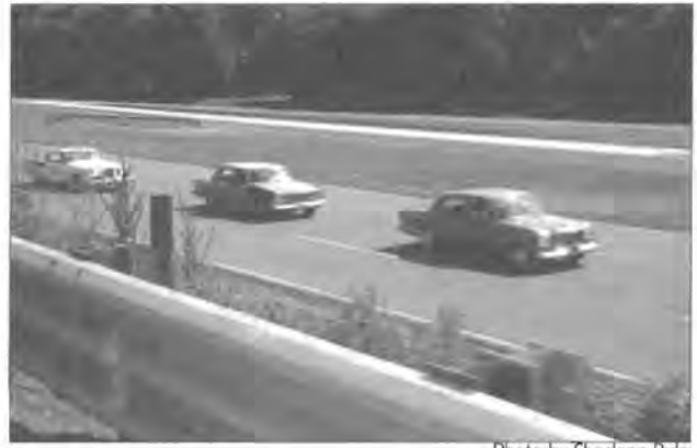
On the front straightaway at the Proving Grounds.

Saturday morning, Studebakers were on the road again, escorted by the South Bend Police Department, and heading for the grandeur of the former Studebaker Proving Grounds. If you've never had the privilege of looking out your windshield at the Studebaker Proving Grounds high banked track as it rolled beneath your Studebaker, you have truly missed one of the best experiences there