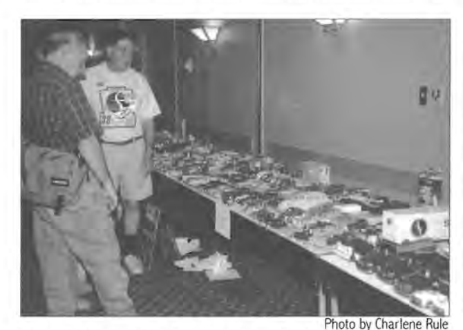
In the Memorabilia Room, a huge display of models

Tuesday continued to produce 95-degree temperatures, more guest arrivals and huge crowds for the Swap Meet vendors. The Streets of South Bend were looking like they did back in the "good old days", with Studebakers everywhere you looked! Our Meet