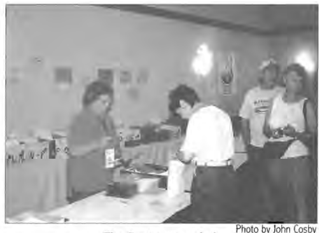
The Registration desk.

The Opening Reception, attended by over 375, provided an opportunity to greet old friends and get acquainted with many new ones. The evening was filled