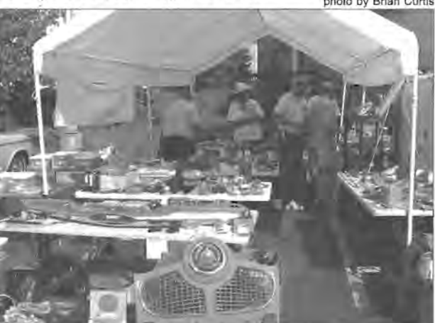
Turning Wheels • November 2005