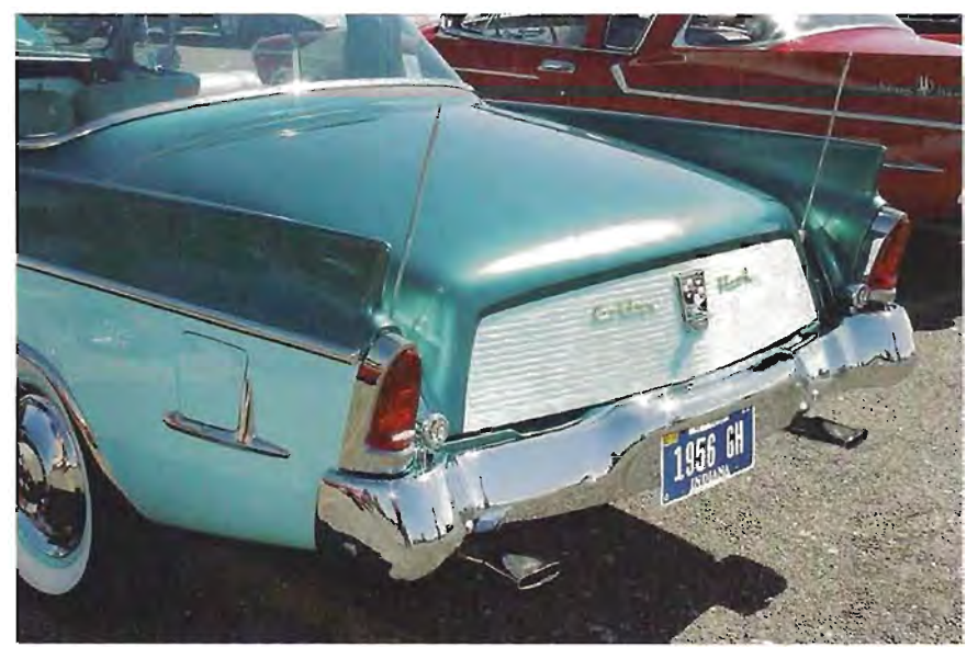
Twin antennae, dual exhaust – flavor of the 50s.