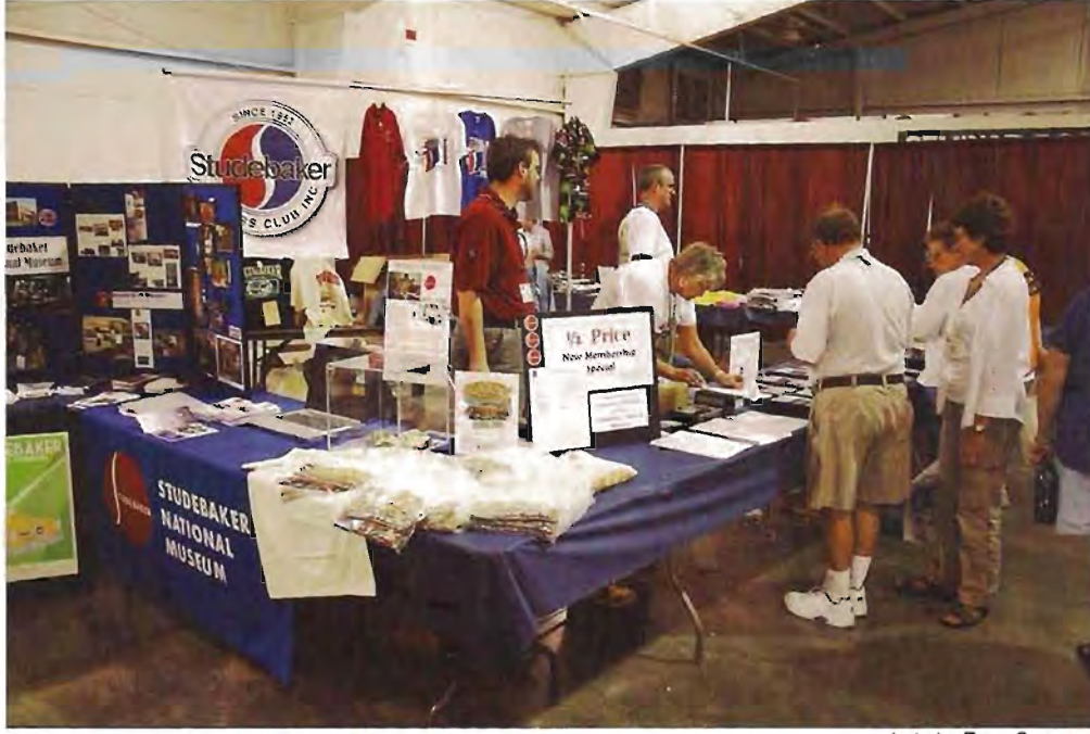
Studebaker National Museum.

Wednesday dawned early; you can't sleep in at a Studebaker meet. It was time to spend most of the day at the swap meet where all the vendors were, where all the goodies were. I got to meet many people, some of them famous (like An-