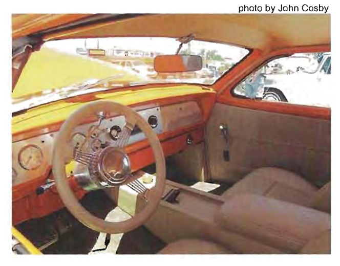
47th Studebaker Drivers Club International Meet