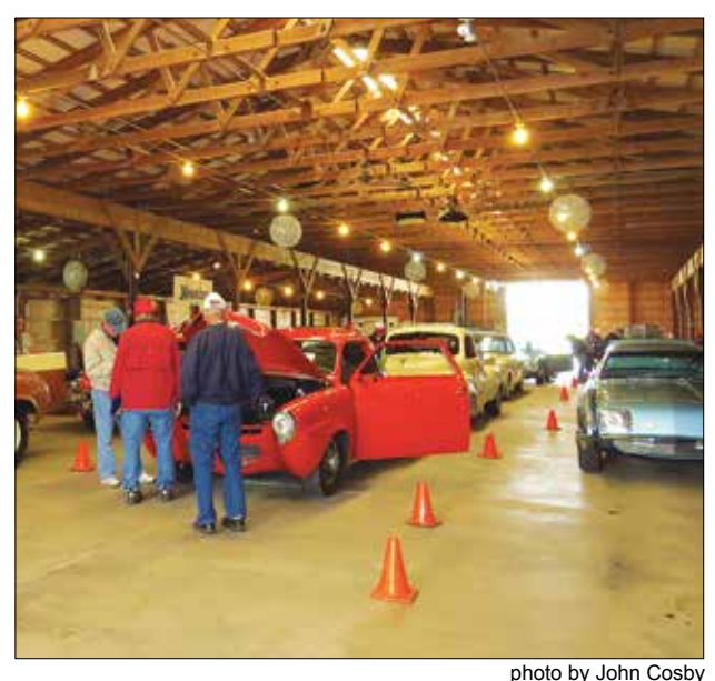
Drive through judging was done inside the large swine barn.

With the rain pouring down on Thursday there was still a steady stream of cars wanting to see the inside of the pig barn. Side by side and end to end, three rows of cars slowly made their way in and to their surprise, once inside they found it empty of pigs and mostly dry but still very cold. They did find several friendly judges waiting to point out